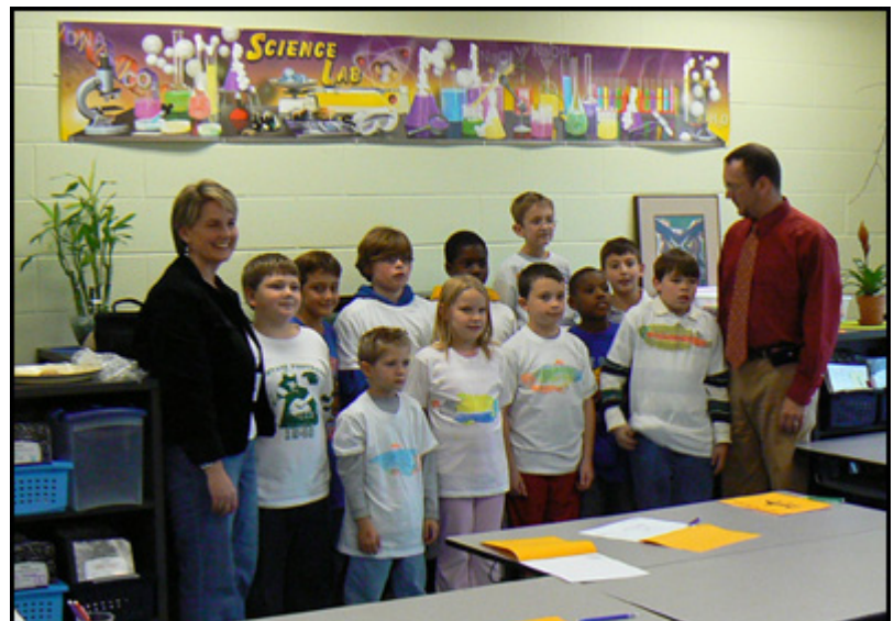
Mrs. Fehr's Science Class at Liberty Elementary School—the TIC kids!

The classroom was filled with anticipation as the cooler was delivered to its place atop the newly constructed trout stools next to the aquarium. As the children took their places in chairs along the front row, parents with cameras crowded in behind awaiting the big reveal.